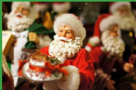
Group of Santas