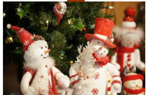
Snowmen gathered round the tree

Have a Merry Christmas & a Happy New Year!